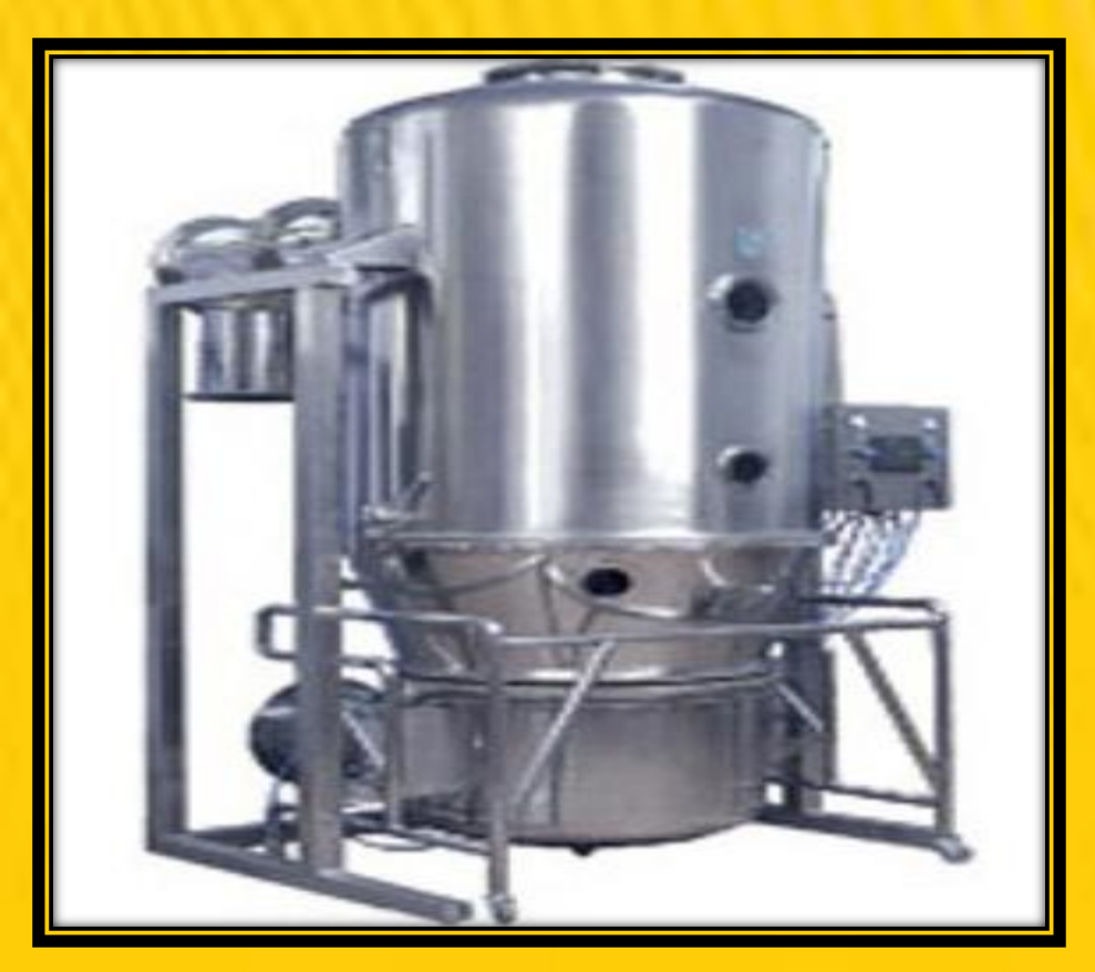
FLUID BED DRYER