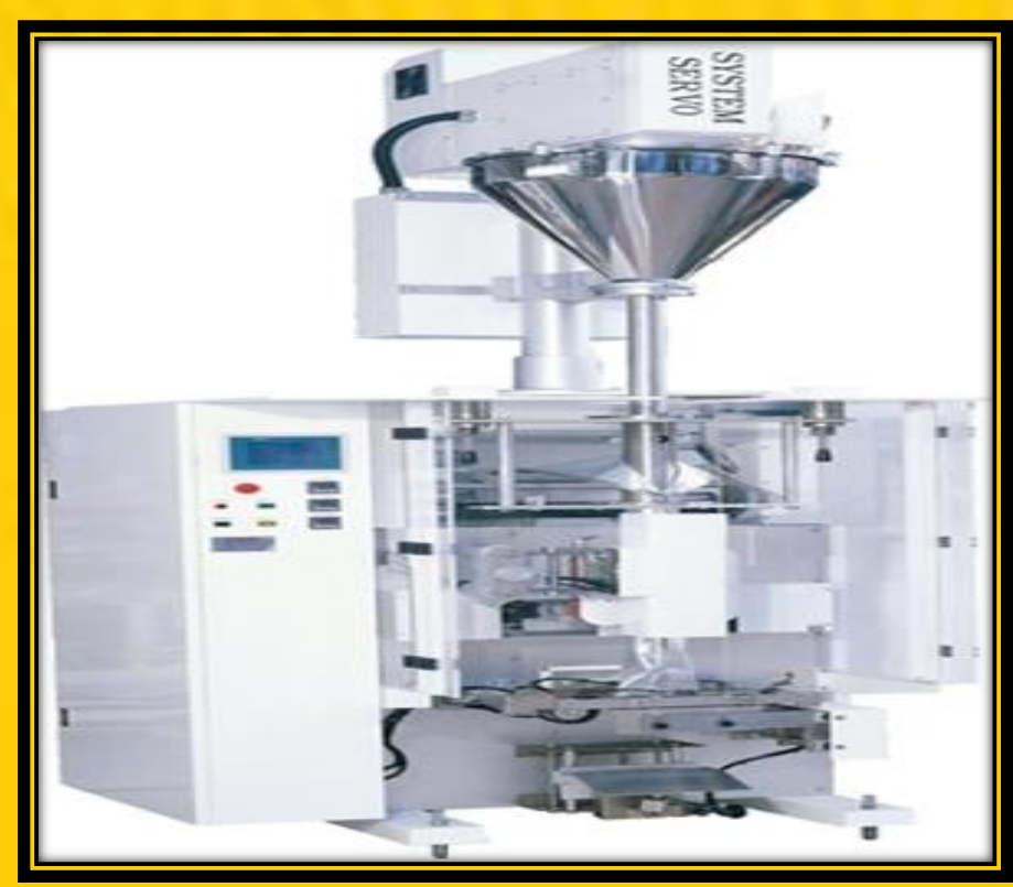
Automatic Bag Packaging Machine